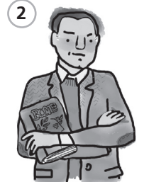
The History teacher