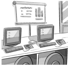
0 IT room

IT room library sports hall playing field science lab canteen