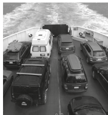
0 f erry