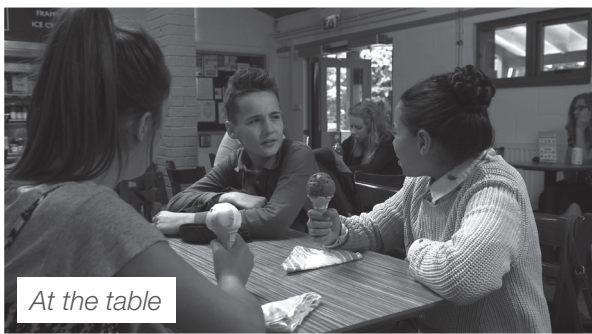
At the table