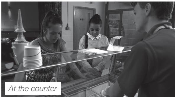
At the counter