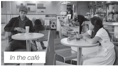
In the café